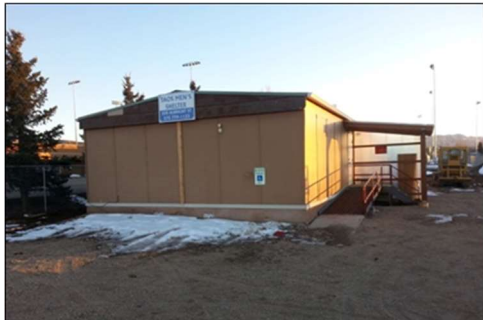
Taos Men's Shelter

The Taos Men's Shelter is located at 220 Albright Street. The shelter provides housing on a nightly basis to 15 – 20 homeless men. We continue to provide the shelter with funds and donations to assist them in their upgrades, maintenance, and personal care.