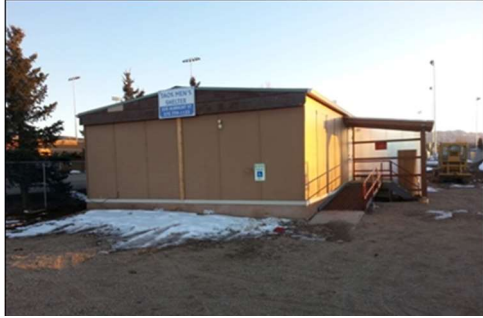
Taos Men's Shelter

The Taos Men's Shelter is located at 220 Albright Road. The shelter provides housing on a nightly basis to 15 – 20 homeless men. We continue to provide the shelter with funds and donations to assist them in their upgrades, maintenance, and personal care.