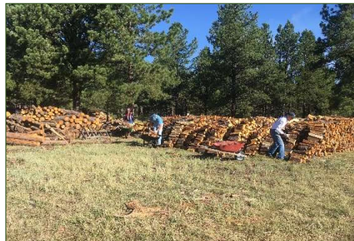
Lots of Wood

The mission of Firewood Angels (FWA) is to supply firewood to those in need of firewood in Eagle Nest, Angel Fire, Black Lake, Ocate, occasionally Cimarron and Taos. Firewood Angels (FWA) had a "banner year" for the summer for 2018 and long, cold winter of 2018 - 2019. We gathered wood from numerous donors and transported the logs to the Elliott Barker Girl Scout Ranch. Our volunteers "blocked" the logs into 16 inch "rounds". Using 3 splitters - one refurbished, one donated, and one purchased by UCAF, the "blocks or rounds" were split and stacked. FWA met weekly weather permitting. By summers end FWA had stockpiled in excess of 65 cords of firewood. In late August, after a work session, we had a celebration potluck cookout. Dependable Dave Anderson brought a grill and cooked the burgers and brats. A good time was had by all. We thought that the largest stockpile of firewood we had ever accumulated would be sufficient. Then came the winter of 2018 - 2019. FWA distributed 84 pickup loads of firewood, 33 bags of kindling, to 30 recipients. The FWA stockpile was gone by the first