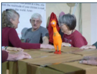
Preparing for a pallet prayer after completing 28 boxes of school kits .

Breathtakingly beautiful snow-covered foothills and mountains greeted the UMCOR West 2019 Team upon their arrival in Salt Lake City on March 17. Twelve experienced volunteers joined five “newbies.” The team represented five different churches as well as five communities to serve as the hands and feet of Christ. The housing accommodations at the Episcopal Church Center of Utah near Mormon Temple Square offered a relaxing environment. Thanks to a generous donation, the first four evenings the team enjoyed in-house catered dinners, ample enough to provide leftovers for some lunches. We began our week together with a thoughtful meditation the first evening, followed by uplifting daily devotions presented by volunteers each morning after breakfast.